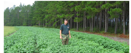
Habitat in and around Townsend Bombing Range (top and bottom) helps preserve the range's training capability.